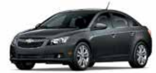
TUNGSTEN METALLIC 3