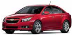
CRYSTAL RED TINTCOAT 1, 4, 5