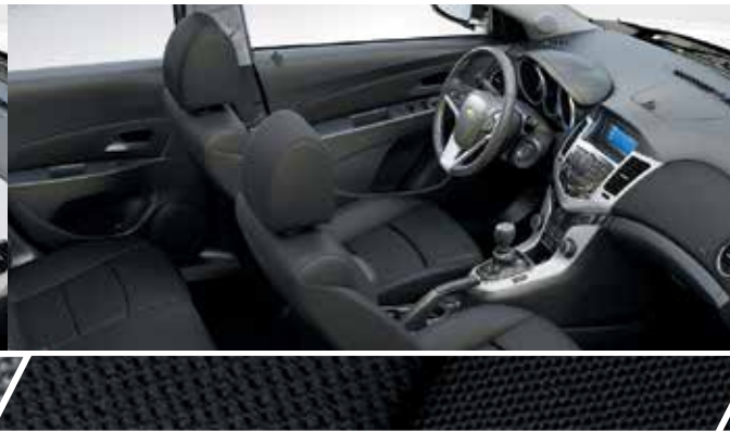
Jet Black Premium Cloth 2