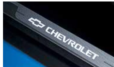
Door Sill Plates