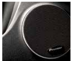
Premium 9-speaker Pioneer audio system.