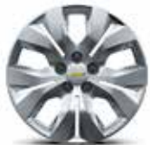
16" Silver-Painted Wheel Cover (Standard on LS)