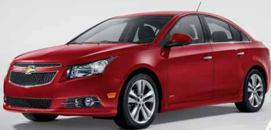
Cruze LTZ in Crystal Red Tintcoat (extra-cost color) with available features.