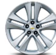
18" Split 5-Spoke Silver-Painted Aluminum (Standard on LTZ)