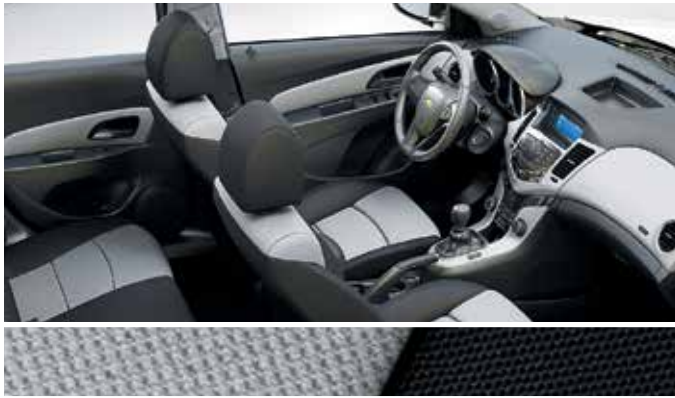
Jet Black/Medium Titanium-Color Premium Cloth 1