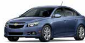
ATLANTIS BLUE METALLIC