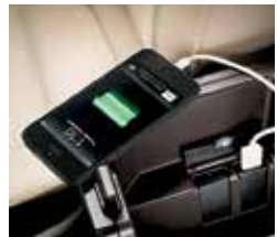
USB connectivity 6

your music library and populate missing song information and album art. And you'll experience it all through the available 9-speaker, 250-watt Pioneer ® premium audio system with high-frequency tweeters.