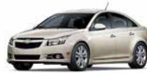
CHAMPAGNE SILVER METALLIC