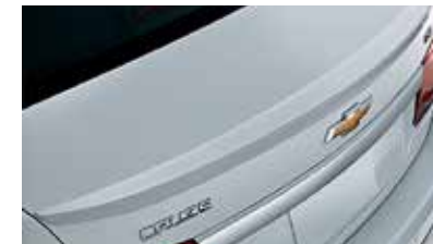
Spoiler (all body colors)