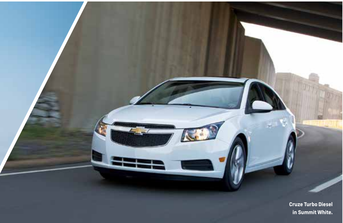
Cruze Turbo Diesel in Summit White.