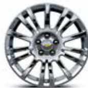
17" 15-Spoke Forged-Aluminum (Standard on Eco)