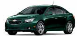
RAINFOREST GREEN METALLIC 1, 2, 3