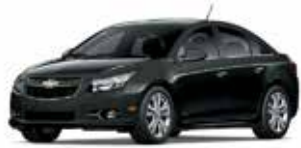
BLACK GRANITE METALLIC 1