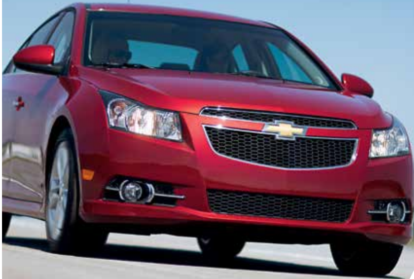
Cruze LTZ in Crystal Red Tintcoat (extra-cost color) with available RS Package.

CUTTING-EDGE PERFORMANCE These days it's all about mileage, and Cruze has plenty to spare. But you don't have to sacrifice power just to save a buck. Cruze takes you farther for less. The available 6-speed automatic transmission offers up to an EPA-estimated 38 MPG highway. Cruze Eco 1 and the all-new Cruze Turbo Diesel 2 take efficiency even further.