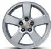
16" 5-Spoke Machined-Face Aluminum (Standard on 1LT)