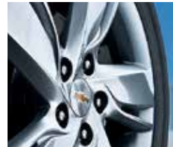
17" aluminum wheel.

CLEAN DIESEL TECHNOLOGY The turbocharged engine in Cruze Clean Turbo Diesel generates at least 90% less nitrogen oxide and particulate emissions when compared to previous-generation diesels. In fact, because of technologies like exhaust gas recirculation, selective catalyst reduction, particulate filter and advanced fuel systems, Cruze Diesel emissions are below strict U.S. environmental standards.