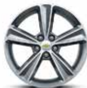
17" 5-Spoke Flangeless Aluminum (Standard on 2LT)