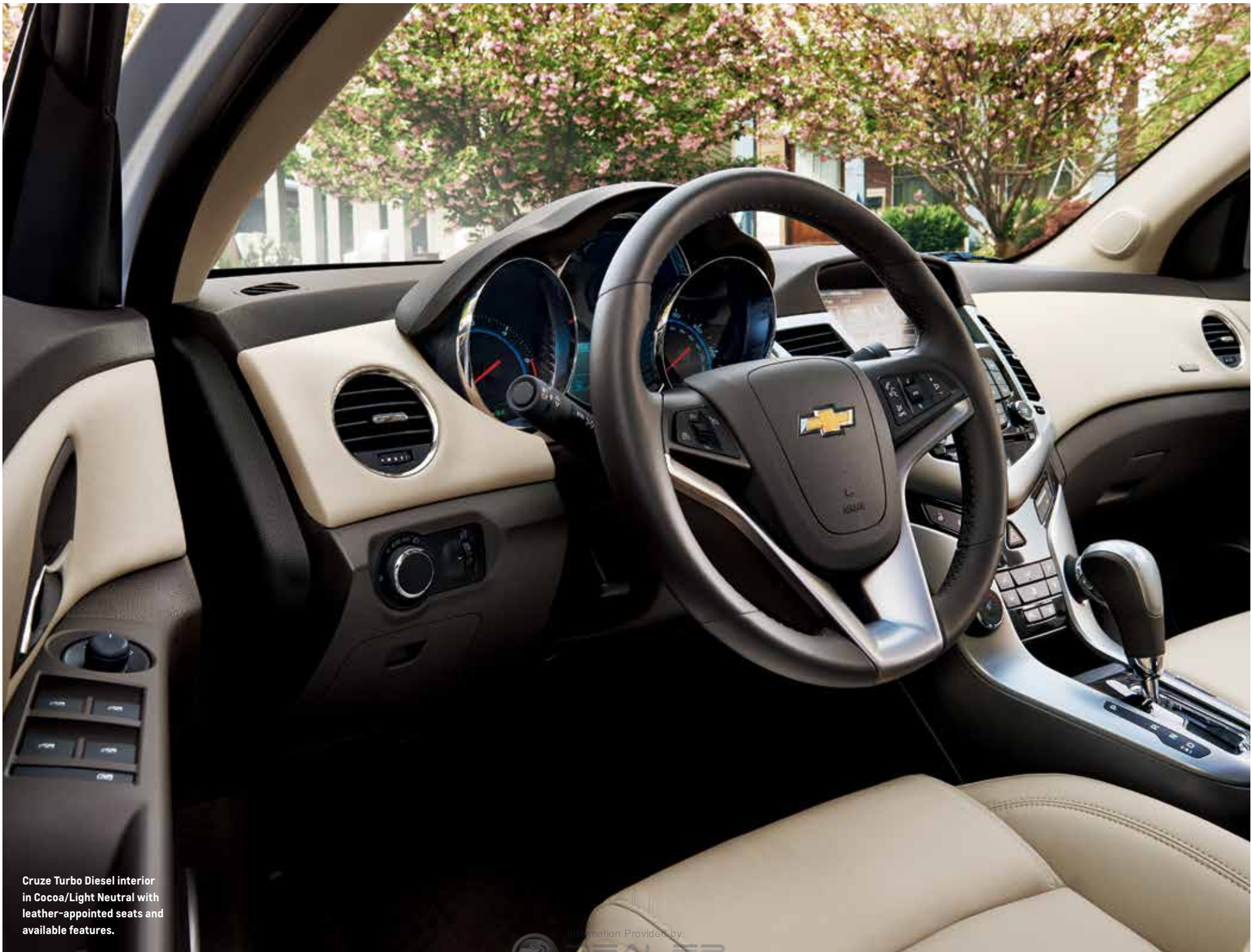
Cruze Turbo Diesel interior in Cocoa/Light Neutral with leather-appointed seats and available features.