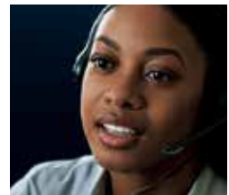
OnStar Advisor 5

ONSTAR 5 Standard for six months with the Directions & Connections Plan, OnStar features Automatic Crash Response. In many collisions, built-in vehicle sensors can automatically alert an OnStar Advisor who is immediately connected into your vehicle to see if you need help.