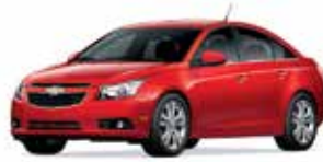
RED HOT 3, 5