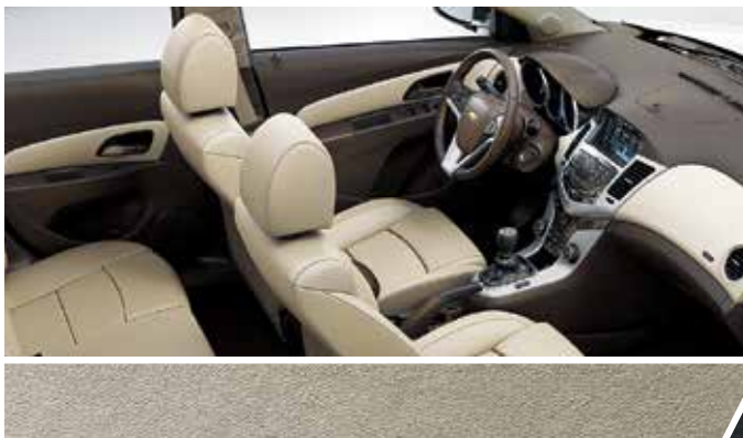
Cocoa/Light Neutral Leather Appointments 3