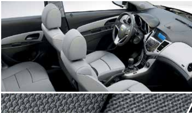
Medium Titanium-Color Premium Cloth 2