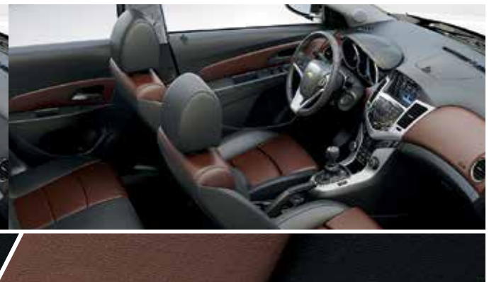
Jet Black/Brick Leather Appointments 3