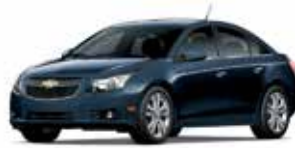
BLUE RAY METALLIC 2