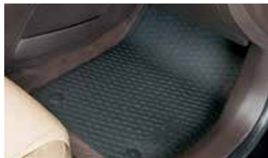
All-Weather Floor Mats