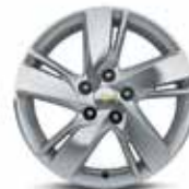
17" Aluminum (Standard on 2.0TD)