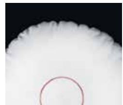
10 standard air bags 3