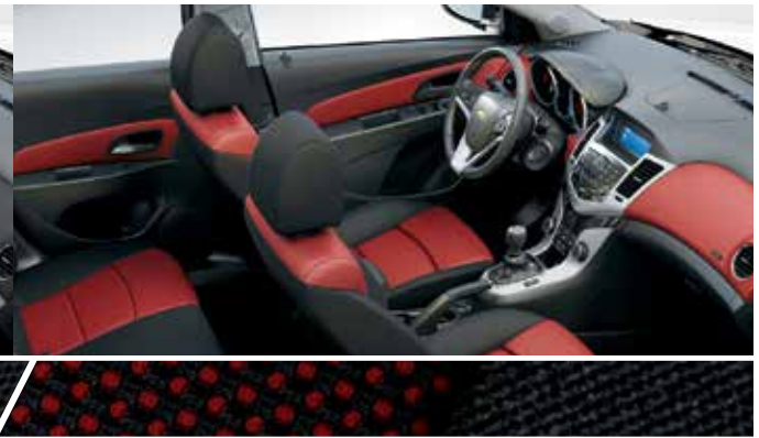
Jet Black/Sport Red Premium Cloth 2