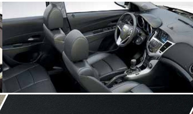
Jet Black Leather Appointments 3