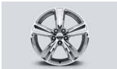
17" Chrome Wheels

PERSONALIZE YOUR CRUZE AT CHEVROLET.COM/ACCESSORIES