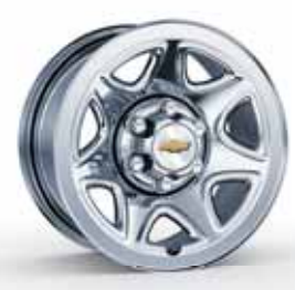
17" STAINLESS STEEL-CLAD (RD7) STANDARD ON 2WT