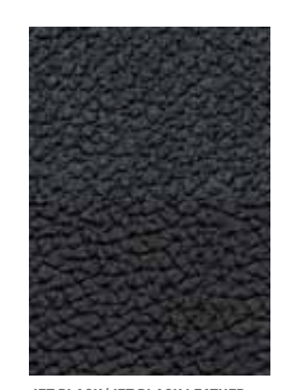
JET BLACK/JET BLACK LEATHER-APPOINTED STANDARD ON LTZ AND LTZ Z71 AVAILABLE ON LT AND LT Z71