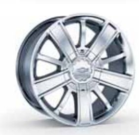
20" CHROME-PLATED (NZJ) STANDARD ON HIGH COUNTRY