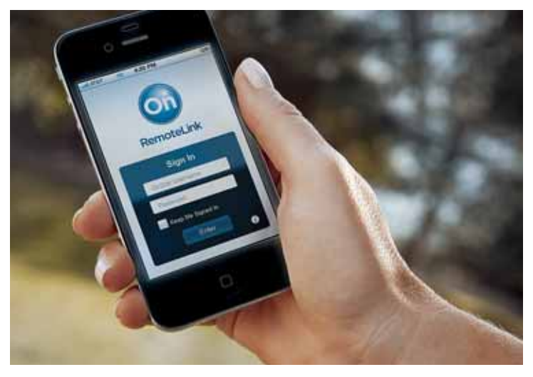
COMMUNICATIONS • OnStar RemoteLink Mobile App<sup>2</sup> • Hands-Free Calling<sup>3</sup> with voice-activated dialing

The level of convenience and safety provided by the various features available through OnStar¹ offers powerfully simple connectivity and peace of mind. To place this capability at your fingertips, Silverado is available with a 6-month trial subscription to the OnStar Directions & Connections Plan. This plan includes: