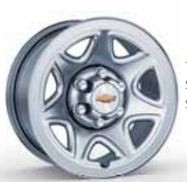
17" PAINTED STEEL (RD6) STANDARD ON 1WT