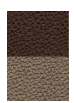
COCOA/DUNE LEATHER-APPOINTED STANDARD ON LTZ AND LTZ Z71