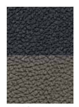
JET BLACK/DARK ASH LEATHER-APPOINTED STANDARD ON LTZ AND LTZ Z71