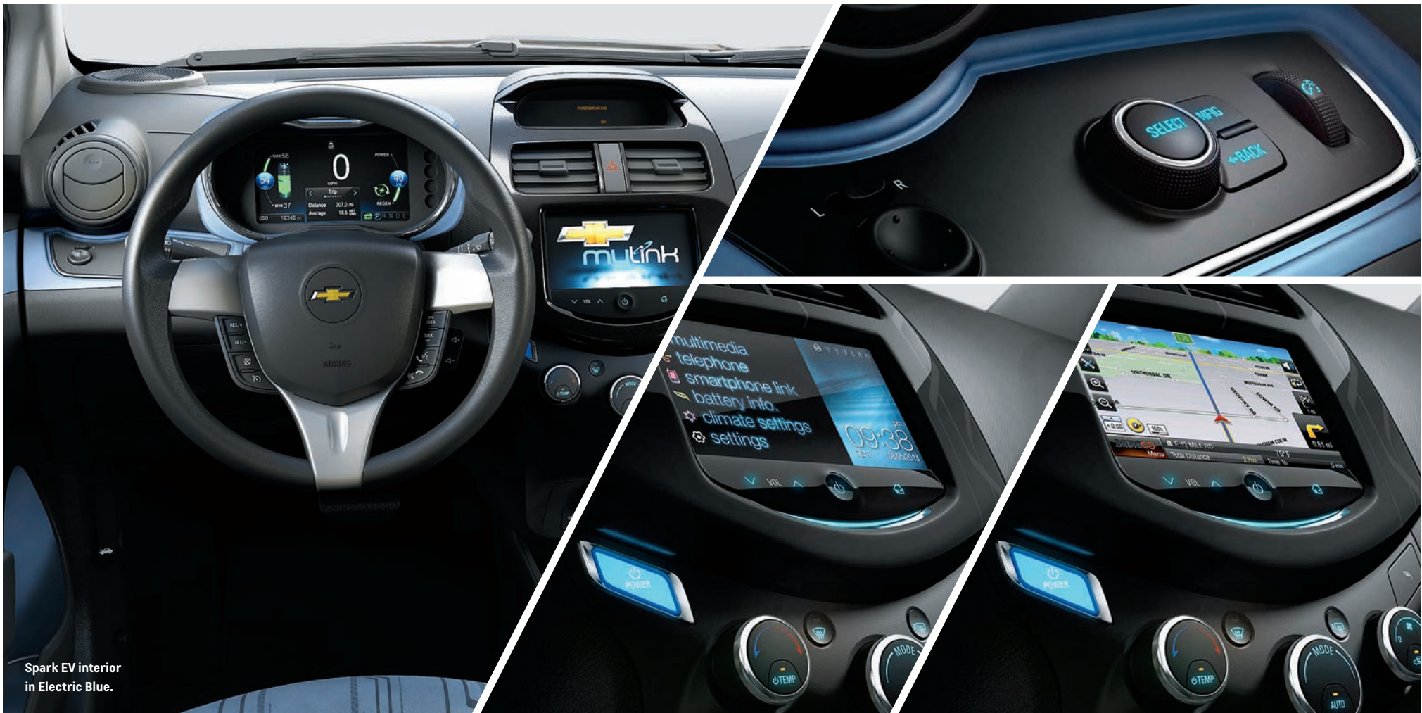
Spark EV interior in Electric Blue.

With a finely tuned ride and 400 lb.-ft. of instant torque, the all-new 2014 Spark EV 1 is the most fun you can have in the most efficient electric vehicle in the retail market. So leave gas stations behind and move forward with 82 miles 2 of pure electric driving. Featuring innovative electric performance and impressive zero-emissions power, Spark EV is the technologically advanced, electrifying way to get around town.