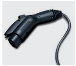
Standard 120-volt cord.

128 MPGe IN THE CITY Efficiency in a gas-powered car is measured in MPG, miles per gallon. Efficiency in an electric vehicle is measured in MPGe, miles per gallon equivalent, and Spark EV is the most efficient electric vehicle available for retail sale. With an impressive efficiency of 128 MPGe city and 109 MPGe highway and an EV range of 82 miles 4 per charge, Spark EV allows you to use less energy to get where you need to go – you'll really feel the savings.