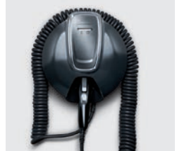
Available 240-volt charging station.