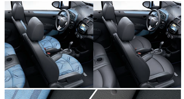
Electric Blue Cloth with Electric Blue Trim