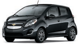
BLACK GRANITE 1