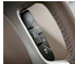
Bluetooth ®7 hands-free calling.

TECHNOLOGY GOES ALONG FOR THE RIDE Being out in the wild doesn't mean leaving creature comforts behind. You're connected and entertained with an available rear DVD entertainment system, voice recognition and a USB port 3 for your iPod. 4 Available SiriusXM NavTraffic 5 offers detailed traffic updates that are displayed on the available navigation radio's 6 2-D or 3-D full-color map. Meanwhile, SiriusXM Satellite Radio 5 (with 3-month trial) lets you enjoy commercial-free music channels, talk, news, comedy and family programming.