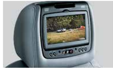
Head Restraint DVD System