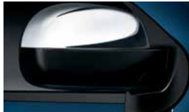
Outside Rearview Mirror Covers