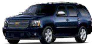
CONCORD METALLIC 1,2,3