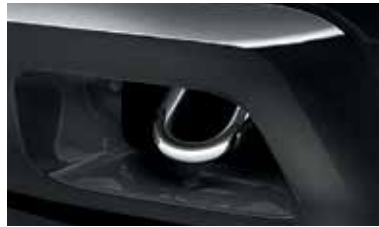
Chrome Tow Hook