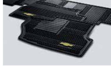
All-Weather Premium Floor Mats