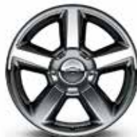
20" Chrome-Aluminum (Available on LTZ)