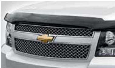
Molded Hood Protector