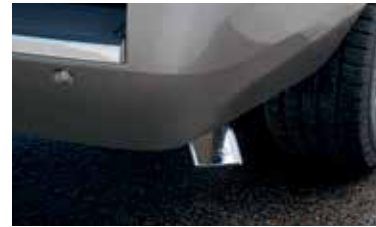
Highly Polished Exhaust Tip