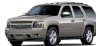
MOCHA STEEL METALLIC