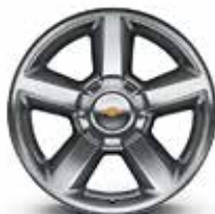
20" Polished-Aluminum (Standard on LTZ; available on LS and LT)