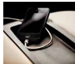
USB connectivity. 3