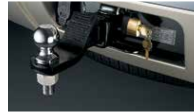
Hitch Ball Assembly