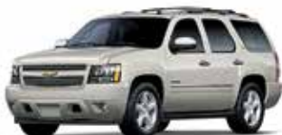
CHAMPAGNE SILVER METALLIC 2