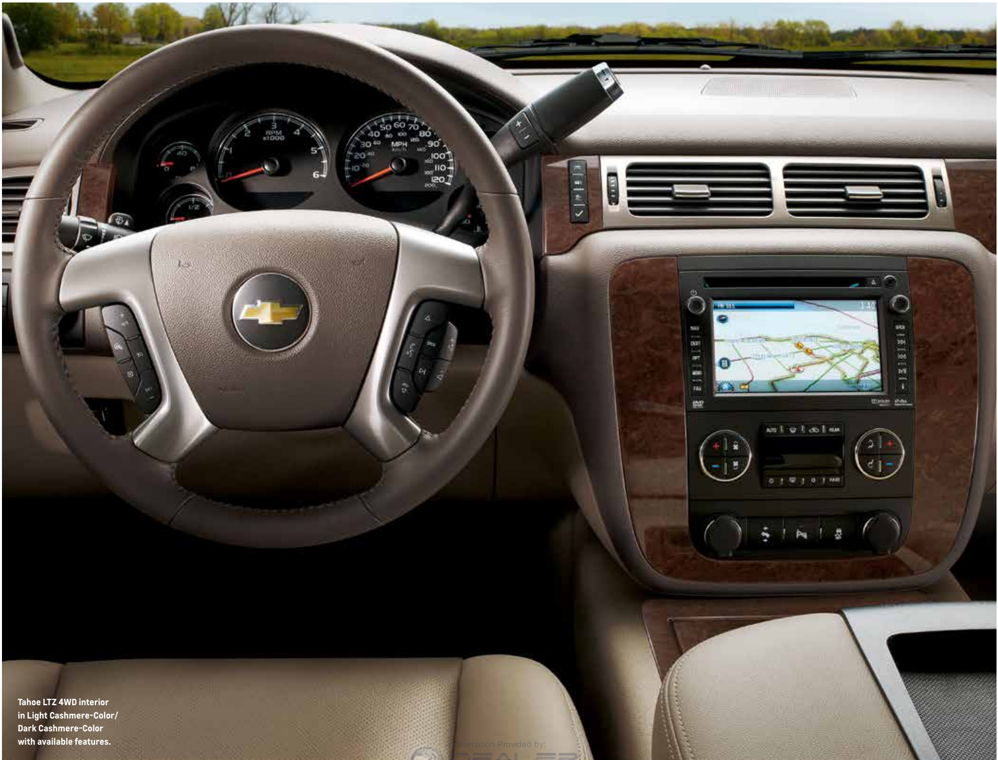
Tahoe LTZ 4WD interior in Light Cashmere-Color/ Dark Cashmere-Color with available features.