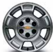
17" Aluminum (Standard on LS and LT)