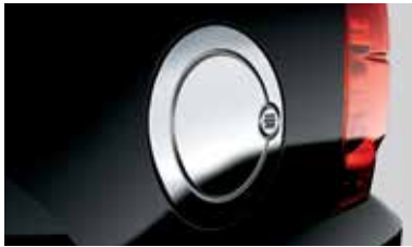
Chrome Fuel Door