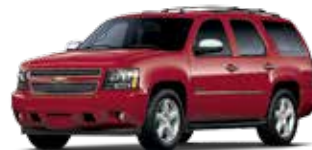
CRYSTAL RED TINTCOAT 1