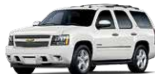
WHITE DIAMOND TRICOAT 1,2,4