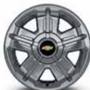
18" Aluminum (Available on LT; requires available Z71 Off-Road Suspension Package)