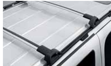
Roof Rack Cross Rail Package