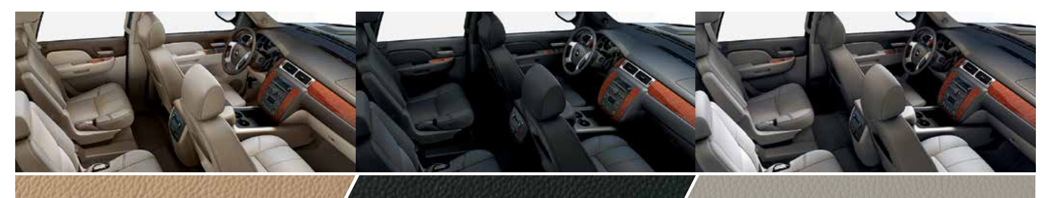
Light Cashmere-Color/Dark Cashmere-Color Leather Appointments<sup>2</sup>